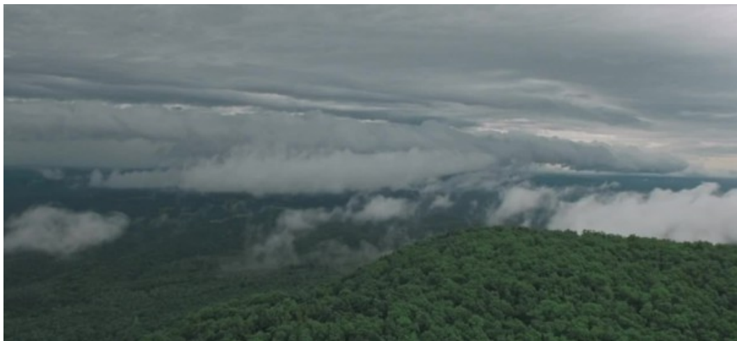
One of the most cinematic drone shots is a slow reveal of the landscape.

Make sure you also go easy on the RC control sticks on the remote. Use gradual movements and remember to accelerate and decelerate slowly; otherwise you will shake the camera around with the quicker movements, increasing your odds of having distortions or 'jello effects' on your footage. Pre-plan and visualize as many of your aerial shots as you can. I recommend scouting your filming location before your shoot so you can factor in limitations of the area. Knowing what you'll need ahead of time will also help you optimize your drone's battery life, so you don't run into a situation where you miss the shot you truly need because your batteries are out of power.